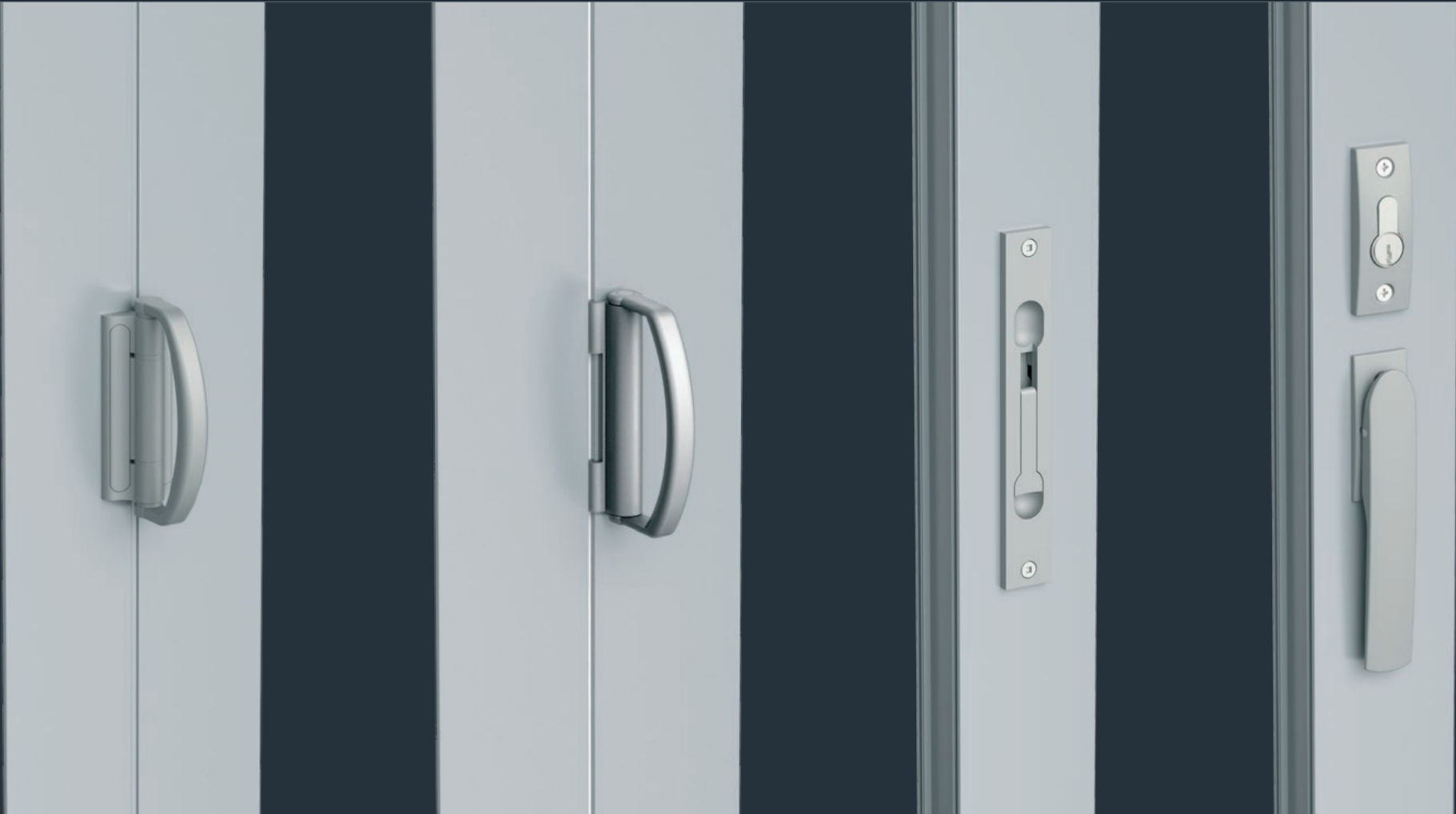
Twin bolt lever